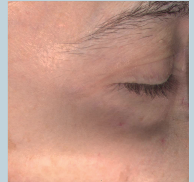
After 4 weeks