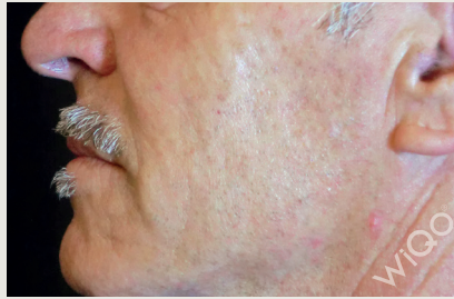
After 4 sessions on a weekly basis