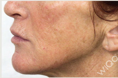
After 5 sessions on a weekly basis